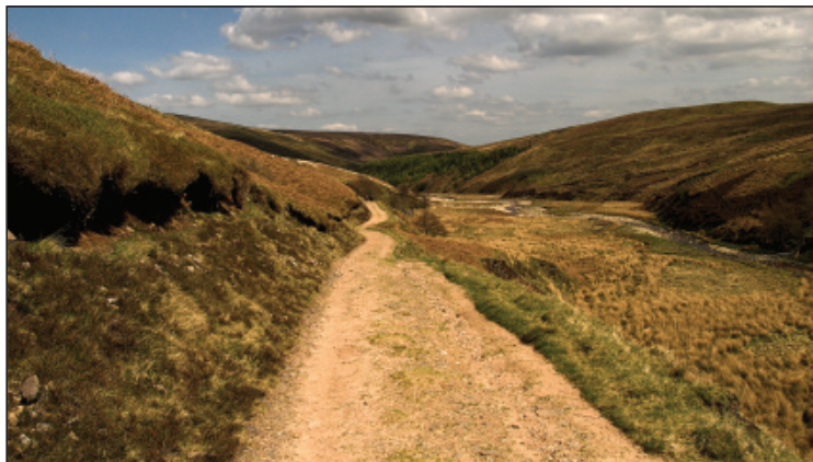
Running parallel to Langden Brook below it, this is a popular route for birdwatchers.