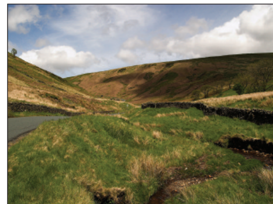
The Trough. The road from Dunsop Bridge winds through the sweeping landscape as it climbs to its high point.