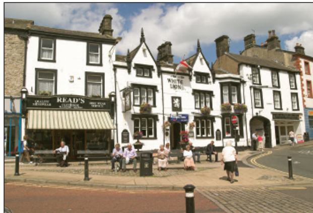
While not in the Forest of Bowland itself, Clitheroe is probably the most important gateway into the area from the east.