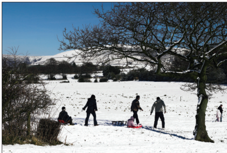
Snow at such low levels is unusual, seen here looking across Bleasdale towards Parlick.