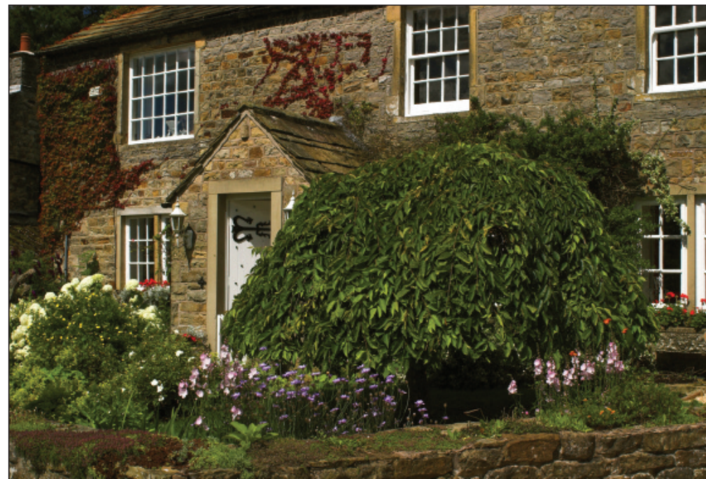
Bolton-by-Bowland Another attractive garden fronting a cottage in this tiny village in the east of the AONB.